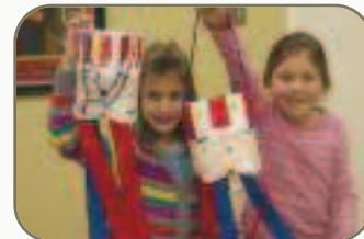
Craft programs for kids ages 7 and up are offered once a month, September through June, and once a week during the summer months.

An imaginary story about a young boy who discovers the wonders of art and science and grows up to be the world famous artist and inventor – Leonardo da Vinci.