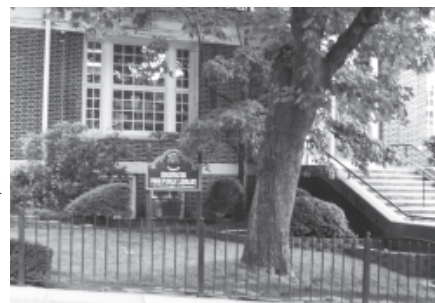
Edgewater PL will be restored to its original Carnegie Library splendor.

In pursuing the library's nomination as an historical site, the current board of trustees sought the professional services of an architectural firm specializing in historical preservation. The board members decided that it would be best to have an architectural firm assess the physical plant of the library, along with its time period structure and historical details, in order to provide an authentic and professional picture of the library as an institution. As the director, my first step was to gather requests for proposals from four architectural firms and present them to the Board of Trustees. In addition, the board hired a professional historical preservationist as the library's project manager.