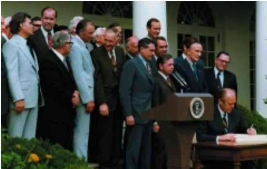
President Gerald Ford signs the Employment Retirement Income Security Act (ERISA), Labor Day 1974.

The lecture will be in the Scholarly Communication Center in the Alexander Library at Rutgers University . To RSVP, call 732-932-7505, or send email to events@rci.rutgers.edu .